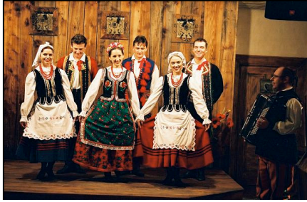
A Polish folk music group

The second option is shopping, as the Christmas will not be far away. Warsaw has many modern shopping centers. The rich offer of the shops, general price level and the exchange rate between Polish Zloty and Euro (or US dollar) make shopping in Poland very attractive. We will take you to the newest, largest and most modern shopping center in Warsaw. On five levels there are over 200 shops, 20 restaurants, car parks for four thousand cars, and a 15-screen movie theater (all foreign movies have subtitles in Polish – no dubbing!).