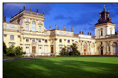
Wilanow Palace

You can use the day to explore Warsaw on your own. If you choose this option, you will receive a guidebook about Warsaw, and the city map. You can consult the tour guide for the places you will want to visit.