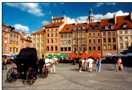
Old Town Market Square in Warsaw

year hundreds of thousands of visitors enrich their knowledge of history and deepen their aesthetic appreciation within its walls. It provides the setting for cultural events and official state ceremonies, as well as visits by figures from international political life.