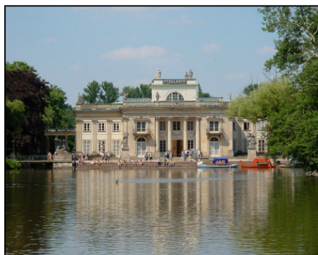
The Palace On Water in Lazienki Park

The motor coach will be a very convenient way to explore Warsaw and to see all the most important locations. We will ride along the Royal Mile – which connected the Royal Castle with the summer residence of Polish kings in Wilanów. The Royal Mile is full of historical buildings, many of which are still used for public functions: Kazimierzowski Palace, Three Crosses Square, Belvedere Palace, Presidential Palace (currently the residence of the President of Poland).