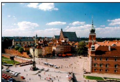
The Royal Castle and Old Town