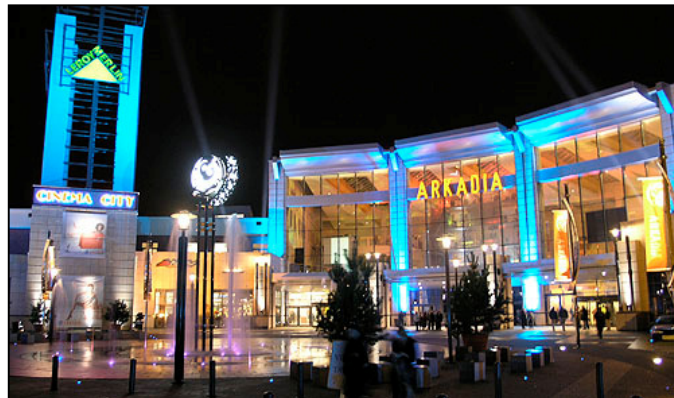
Arkadia – the largest shopping center in Central Europe

This is the last day of your stay in Warsaw. After having a breakfast in the hotel, you can make arrangements to get back to the airport, or - if your flight departure time allows - to return to the city for more sightseeing or shopping. We hope to see you on our other tours to Poland!