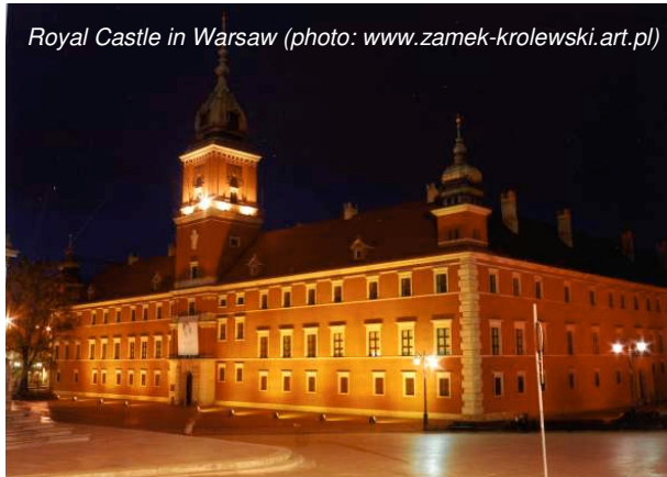
Royal Castle in Warsaw