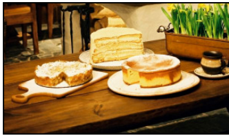
A selection of Polish desserts

Polish cuisine is famous for its delicacies, and therefore it cannot be missed to celebrate Thanksgiving in the Polish capital – Warsaw! The American tradition of Thanksgiving turkey will meet the Polish tradition of hospitality – which is the perfect blend for a wonderful Thanksgiving weekend. Warsaw is a city full of history, and a booming place with bright perspectives for the future. You are most welcome to come over, and experience its past and present. You will not be disappointed!