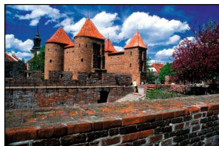
Barbican in Warsaw

After the visit to the Castle, we will have a short walk through the picturesque narrow streets of the Old Town. You will see the Old Market Square with a status of siren – symbol of Warsaw. We will continue on to the Barbican – part of the medieval city walls, and we will board our motor coach near the Warsaw Rising Memorial.